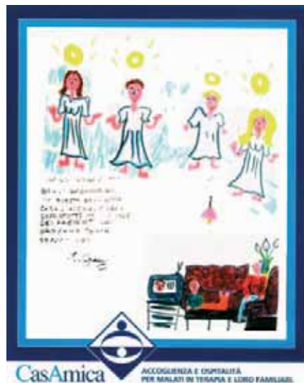
A Hosting Home as seen by a young patient

Sponsorship of this conference may be seen as part of Indena's commitment to health care and particularly to the treatment of serious diseases.