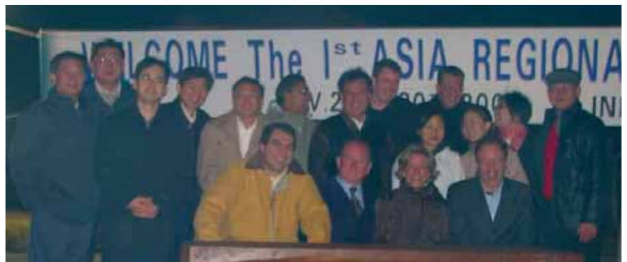
Partners and Distributors participating to the 1st Asia Regional Meeting

Last November the first Indena Asian Pacific Regional conference took place in South Korea. As part of our aim to provide maximum support for partners and distributors, who actively promote Indena products, the Scientific Department conducted a number of educational seminars during the gathering in Seoul. These specifically targeted seminars highlighted the features of key products, and included an interesting session on product branding and advertising designed to foster local promotion techniques.