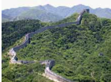
Chinese Great Wall