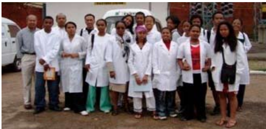
The group of Madagascan students

Last year Indena gave its wholehearted support to the twinning programme linking two high schools, one located in the Madagascan town of Tananarive and the other in the French city