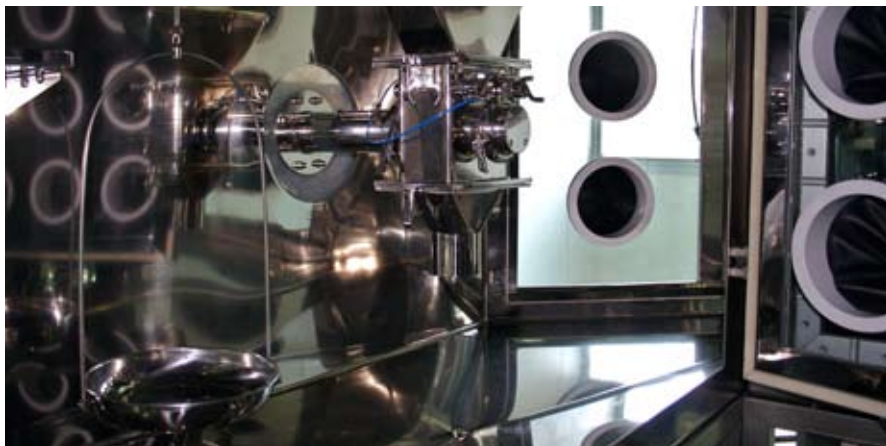
New glove boxes unit

Indena is constantly innovating and seeking new ways to make industrial production and processes ever more efficient. In order to cope with increasing customer demand, every year Indena is investing in cutting edge production equipment for its plants throughout the world. In its main Italian manufacturing site in Settala the company has recently launched a new production line for cytotoxic compounds and new solid/liquid separators are replacing older ones.