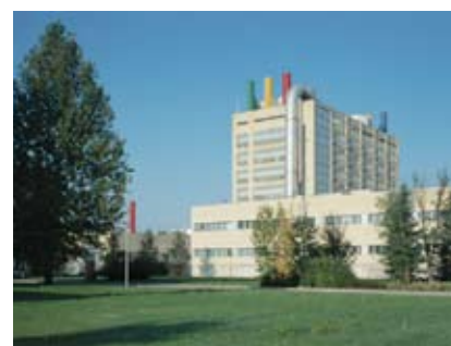
Nerviano Medical Science Management and Oncology Business Unit Headquarter